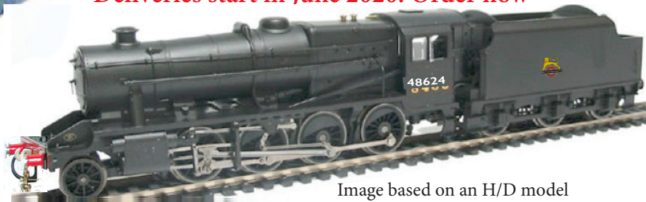
Image based on an H/D model

HORNBY DUBLO HAS ANOTHER BIG BROTHER THE 8F HAS GROWN UP. Deliveries start in June 2020. Order now